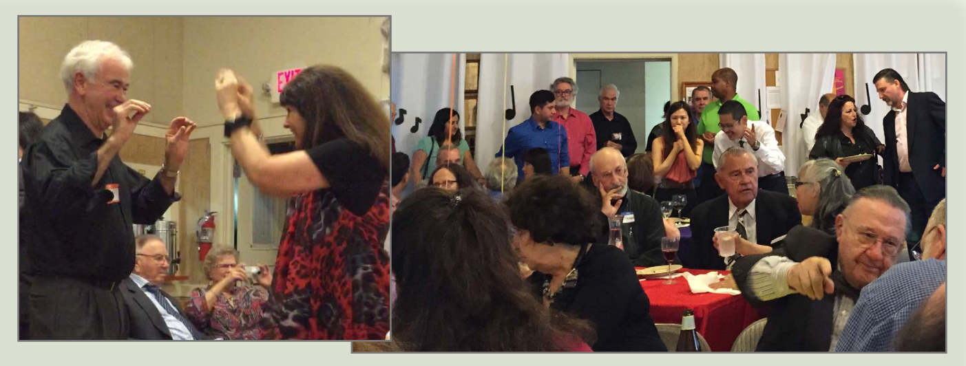
People had a lot of fun!