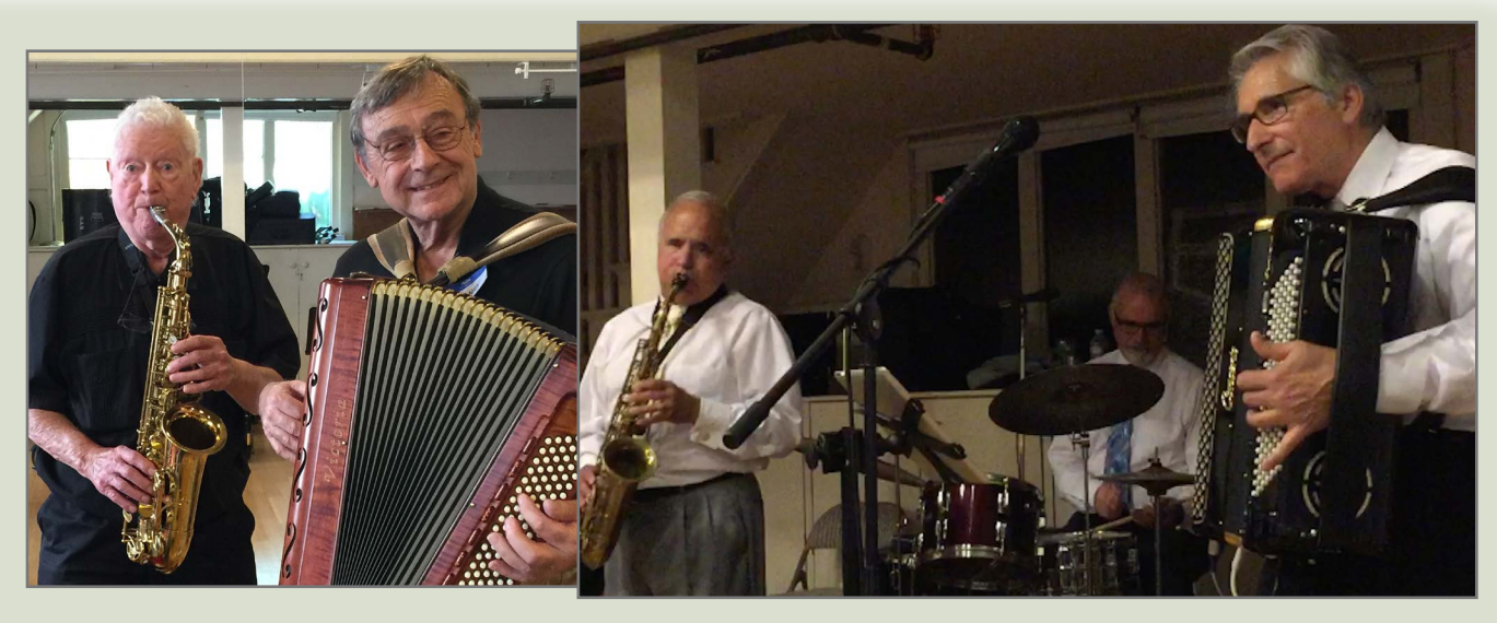
There was wonderful music!