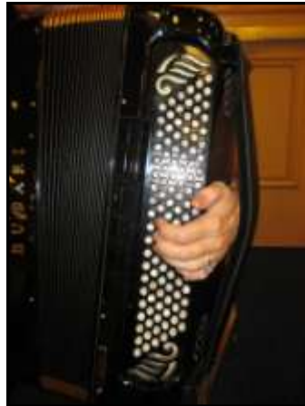
NOT the best positioning of the left hand!