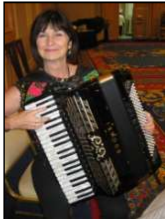
NOT the best way— don't let that smile fool you!