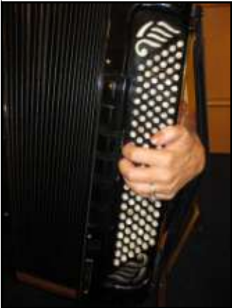
The BEST positioning for the left hand!

hand through the strap and rest all 5 fingers in a row starting with little finger on C, 4 on G, etc. and make sure you can reach the counter bass row in this way as well. Again, try not to cock the wrist in relation to the