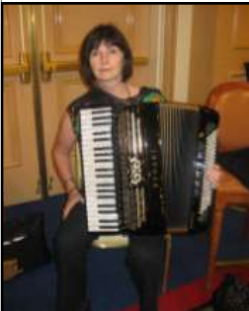
The BEST way to position the accordion!