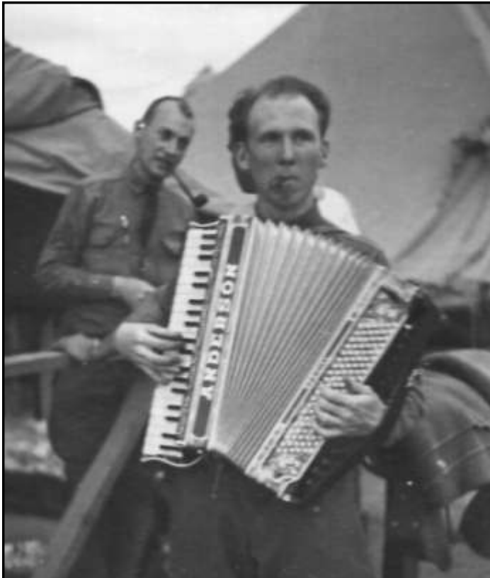
Leroy Anderson entertaining fellow soldiers in the U.S. Army Counter Intelligence Corps during WW II.

that composer Leroy Anderson, amongst many talents, also played the accordion?