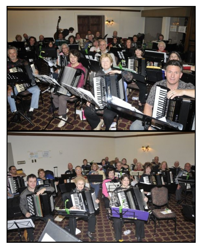
Get out your magnifying glass! Can you spot the many members of our club in attendance?

Mornings were devoted to orchestra rehearsal, and afternoons to workshops, master classes, and section rehearsals.