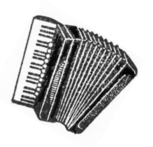
The official instrument of San Francisco!