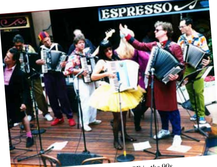
Those Darned Accordions, playing in SF in the 90s

Whiskey and Women • www.whiskeyandwomenmusic.com