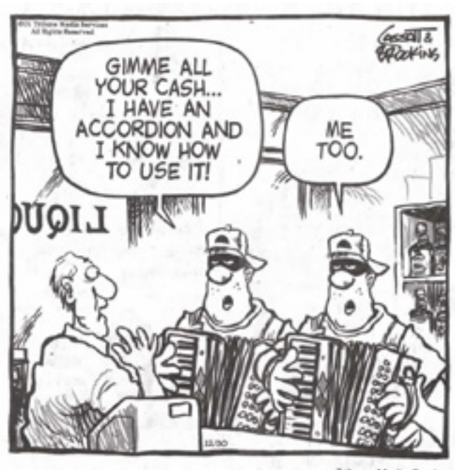
Tribune Media Servic