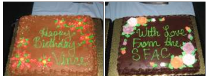
The two birthday cakes for Vince, side by side, complete the message