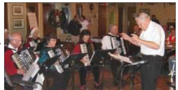
The SF Accordion Chamber Ensemble

New York, New York ; Grande Marcia Italiana ; Re-pasz Band ; Irish Washerwoman ; White Christmas ; and the beautiful Prisoners' Chorus from Verdi's Nabucco .