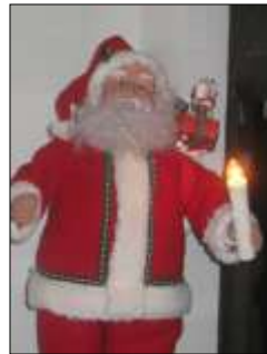
Ho! Ho! Ho!