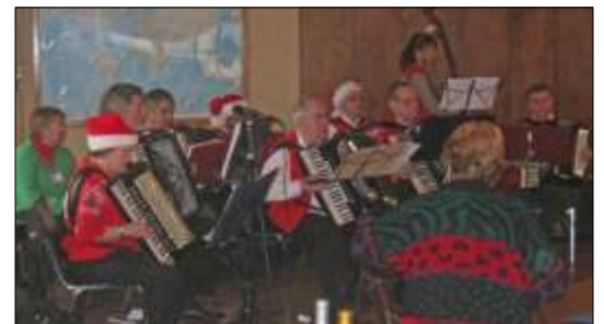
The San Francisco Accordion Band (Fun Band)