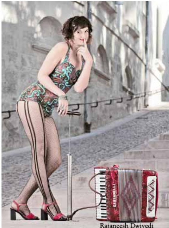
Jet Black Pearl

Playing warm up or during the break is a great, casual way to share your talent and hone your performance skills. Although our featured performers are scheduled almost all the way through June, we have lots of opportunities during the first part of the meeting for people who would like to play a short 10 or 15 minute set, or even just a couple of songs. Contact Dominic Palmisano at 415-587-4423 or email accord47@gmail.com , or Lynn Ewing, 650-453-3391, or ewinglynn@gmail.com