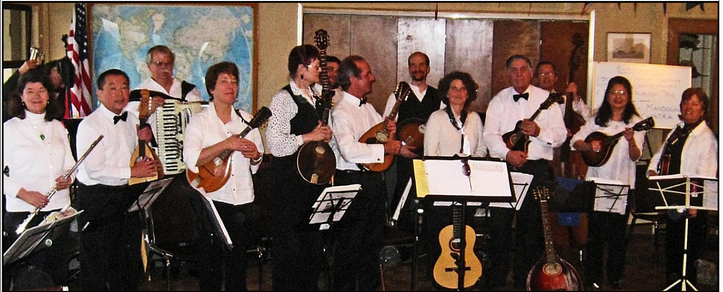
The Aurora Mandolin Orchestra!