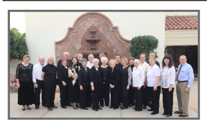
ATG Members at recent Mesa Accordion Event