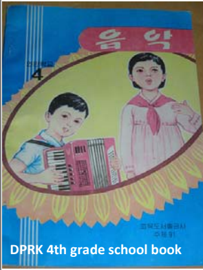
DPRK 4th grade school book

at a lesson is something I can relate to all too well. I cast no stones at anybody for that.