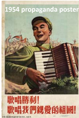
1954 propaganda poster

Will we ever see the day when we can look past our differences to this shared love? If all our leaders played, perhaps we would see what history would record as "The Accordion Accord." or "The Reedy Treaty." While it would be nice to hear more bellows and less bellowing, I have to wonder just how it would sound if we did.