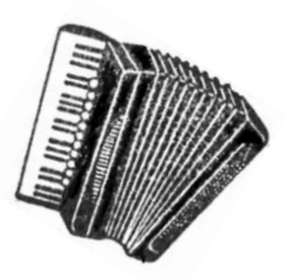
The official instrument of San Francisco!

World's First Accordion Club 1912-2010 גנגע Newsletter for May 2010