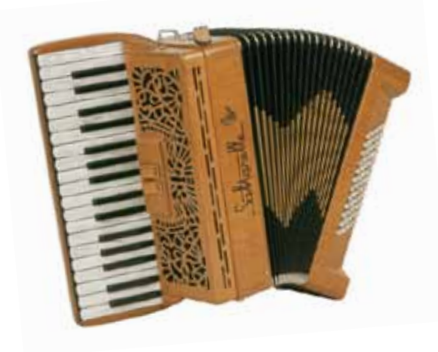
The World's First Accordion Club since 1912