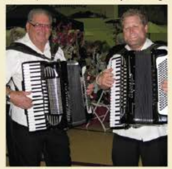
The Truccos Central California Legends