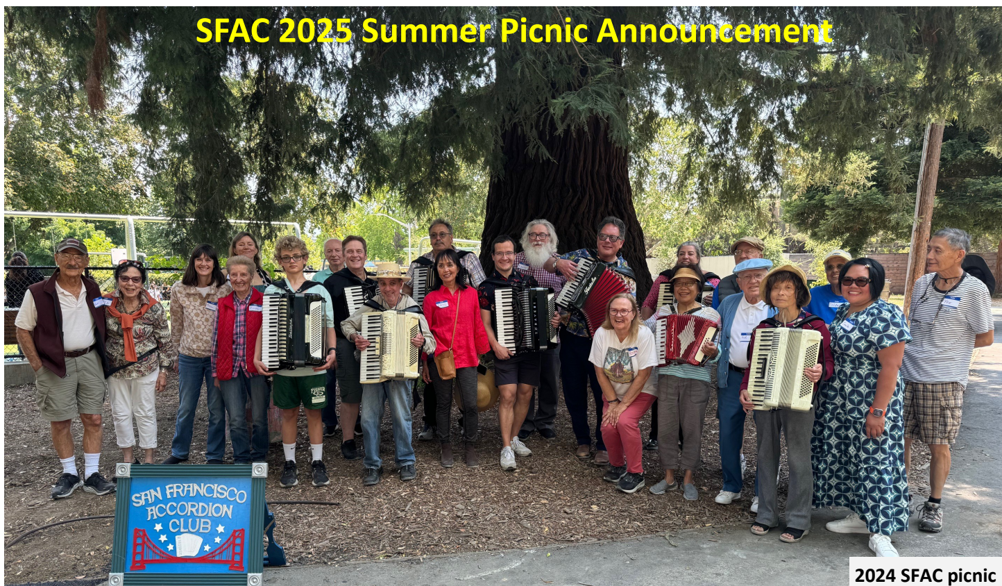
2024 SFAC picnic

Mark your calendar for the 5th annual Accordion San Francisco Accordion Club Picnic in the Park! We will start on Sunday July 27, 2025 at 11:30AM and end around 2:00PM, although there is no rigid ending time. All Club members are wholeheartedly invited!